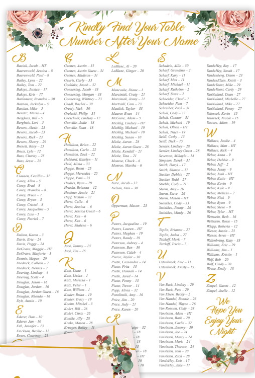
Large Format Seating Charts