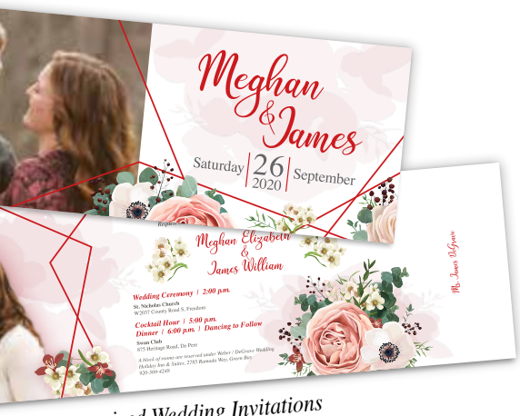
Customized Wedding Invitations