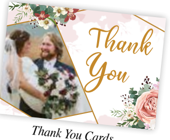
Thank You Cards