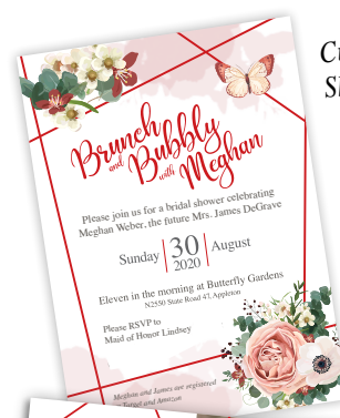
Customized Bridal Shower Invitations