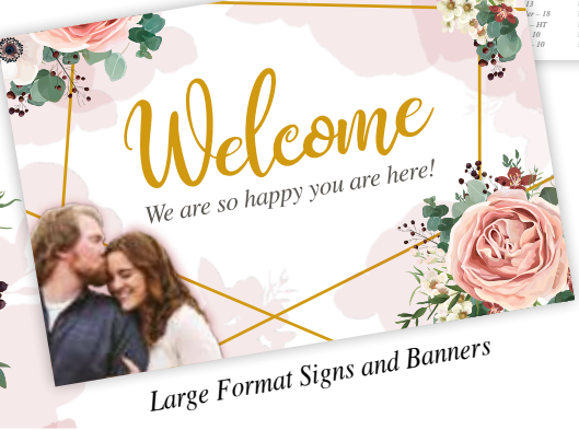
Large Format Signs and Banners