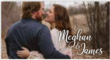
Save The Date Postcards or Magnets