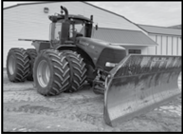
CIH STX400 4WD w/Grouser AgPro760 16' silage blade, 710/70/42's w/duals, PTO, (6) hyd's, 4100 hrs, "The Right Kind!"

FARM LINE #1 Complete retirement line, VanRossum Dairy LLC of Kaukauna, WI