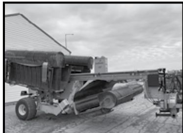
Oxbo 334 34' (3) section hay merger, 2pt swivel hitch w/self-contained hyd, "Well Maintained, It's Excellent!"

...AND MUCH, MUCH MORE ALREADY CONSIGNMENT!