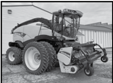
NH FR 600 Forage Cruiser w/8RN Kemper corn & hayhead, 50" rubber w/duals, RWA, 2050 cutterhead hrs, "Totally Impressive!"

FARM LINE #2 The Park Farm, Inc from Kiel, WI; Having discontinued the dairy operation, will not liquidate their harvesting equipment