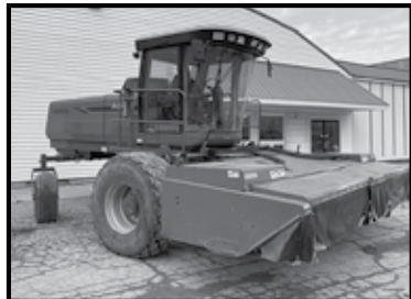
Agco Hesston 9365 15' self-propelled discbine, dual conditioning system, 2473 hours, "Super Sharp!"

FARM LINE #2 The Park Farm, Inc from Kiel, WI; Having discontinued the dairy operation, will not liquidate their harvesting equipment