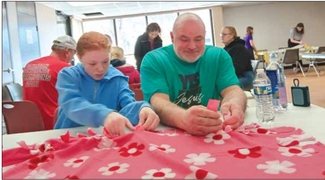
Volunteers work on a tie-blanket at a recent charity event held at the Brillion Community Center. Home Aweigh Acres organized the group, and serves area counties to help benefit children.

Home Aweigh Acres, Inc. (HAAI), which serves Calumet, Manitowoc, Sheboygan and Outagamie counties, hosted the event. The event produced more than 70 fleece tie-blankets for the patients at the Ronald McDonald House of Children’s Hospital of Wisconsin. The event marked the third time there has been a collaborate event since the two organizations came together last August.