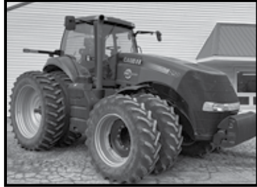
CIH 290 MAGNUM MFWD w/ONLY 2200 (1) owner hours, "All the Bells & Whistles, Absolutely Awesome!"