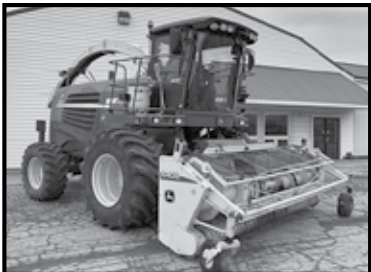
JD 7450 self-propelled chopper w/8RN Kemper & 640B hayhead, 1797 cutter head hrs, "Loaded & Mint Condition!"