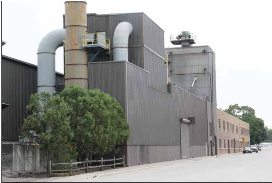
The redevelopment of the former Brillion Iron Works, pictured here in 2017, is in limbo as the Brillion Works group and City of Brillion continue to try to make clear plans for its future.